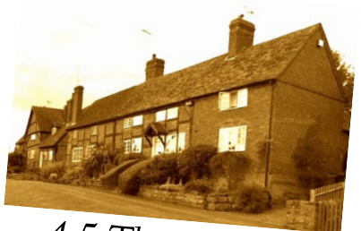
4-5 The Bank