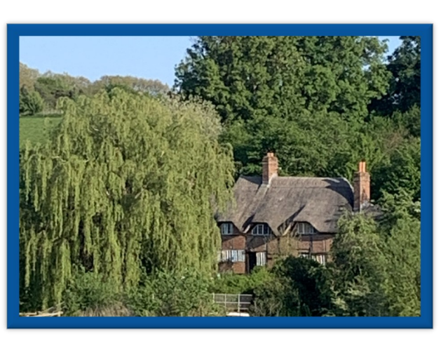
Front cover: Motslow Cottage in the sunshine