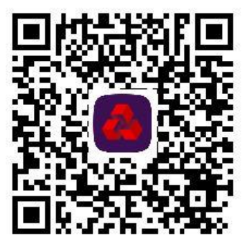
Scan to pay Stoneleigh and Ashow News

Please remember to clear the reference box on the payment page and add your name as the reference so I know who you are