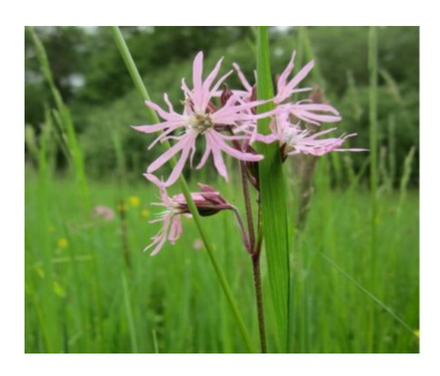
Ragged Robin flower, please see the Orchard article.

ADVANCE NOTICE – July 20<sup>th</sup>, 2024 – SVC ANNUAL DUCK RACE! Get Quacking!