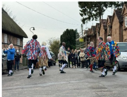
Morris men outside the Club on Boxing Day.

SVC Committee is busy as ever planning events for members to enjoy. Please keep an eye on the information board outside the Club for further details / last minute changes.