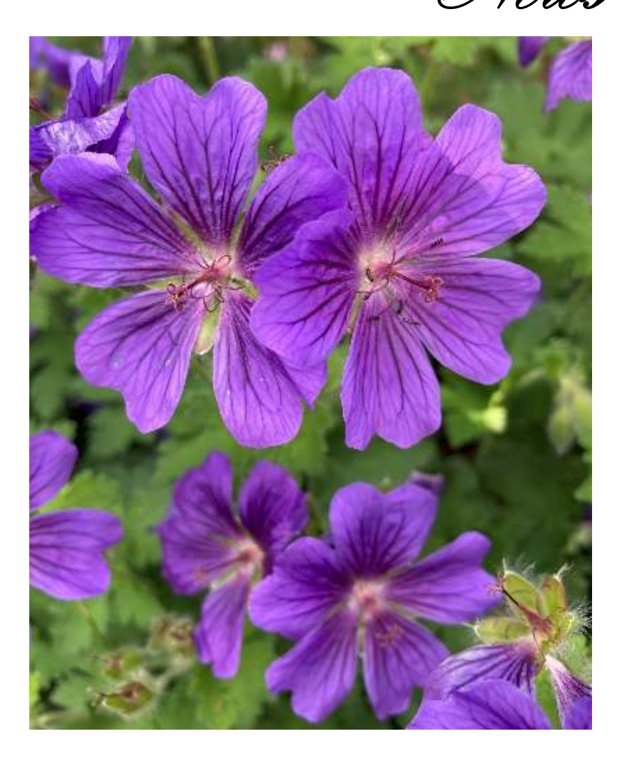
July / August 2022