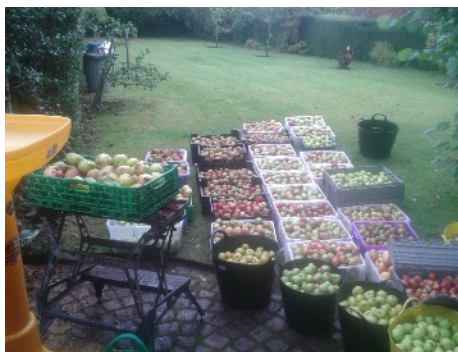
Apples awaiting a pressing