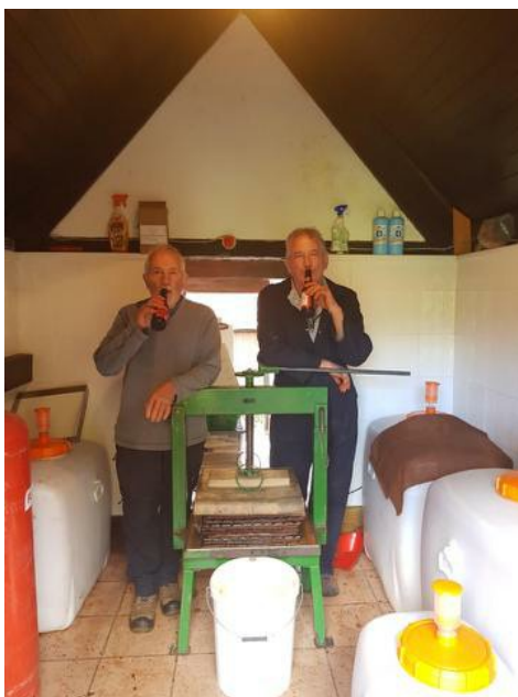
Celebrating Harvest of 2021