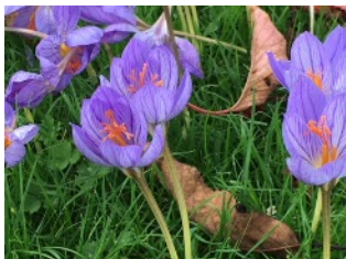
Autumn Flowering Crocus taken at Hidcote Manor gardens