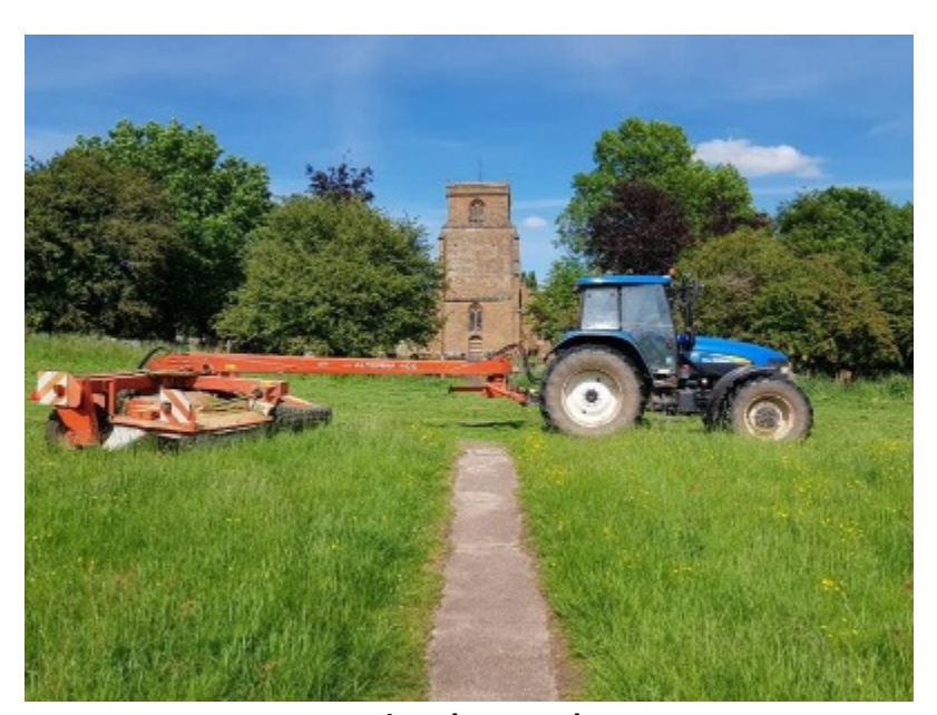
Mowing the Meadow