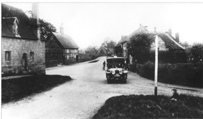
Stoneleigh in days gone by; rather a contrast!

Please look out for the survey; we need as many residents as possible to respond.