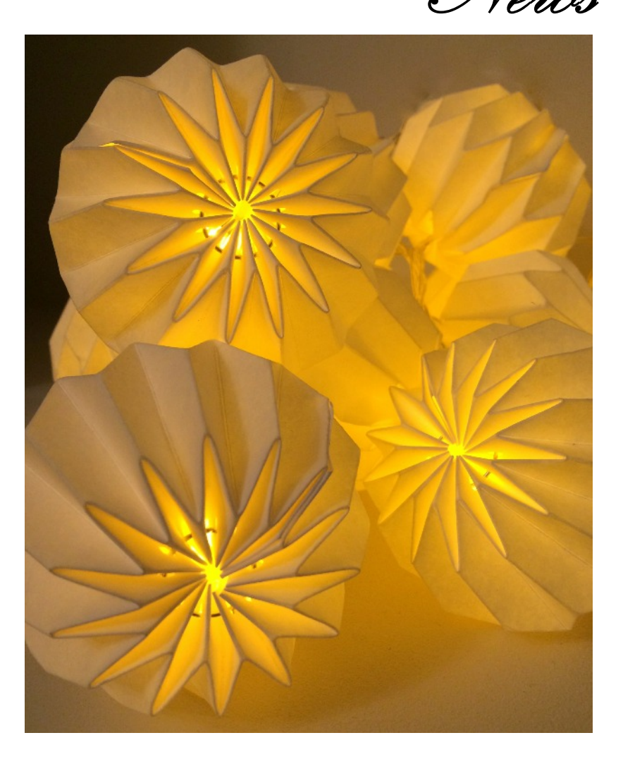
December 2018 / January 2019