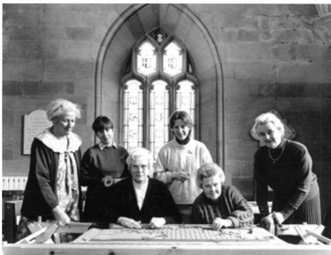
Early Stoneleigh Stitchers