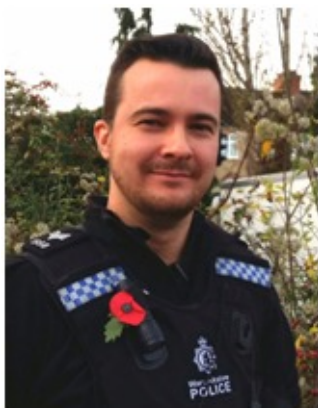
PS 1958 Kitson