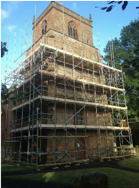
Centuries' old St Mary's church under repair.

During the first 3 weeks the Contractor will be engaged in site protection, erecting scaffolding both externally and internally and erecting hoarding so, apart from some internal work on the tower steps, the major work on stripping the gutters and roof will not commence until the 5th week.