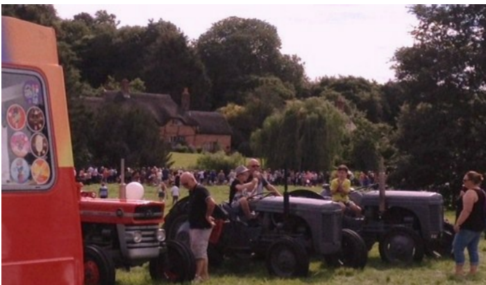
Crowds gather at the finish line, but some are more interested in tractors than in ducks.

As for the ducks, after some discussion the SVC committee was asked to adjudicate and agreed that that the first placed duck was the first one to hit the board NOT the first one out of the water.