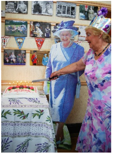
The Queen waits to blow out her candles