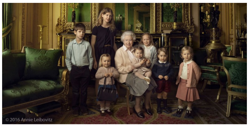
A portrait of Her Majesty the Queen (with her five great-grandchildren and two youngest grandchildren) to mark Her Majesty's 90<sup>th</sup> birthday

A donation will be made to the Warwickshire Air Ambulance