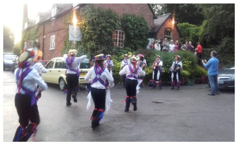
Ashow Club hosts visiting Morris dancers from Harbury, Wednesday 8<sup>th</sup> June

Cricket at Stoneleigh Abbey