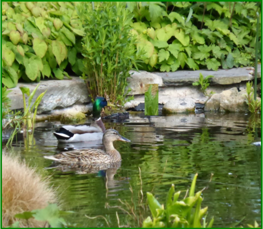
Ducks visiting the garden pond