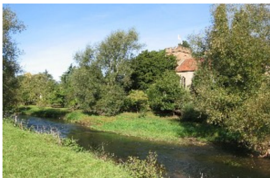
Ashow Church from across the river