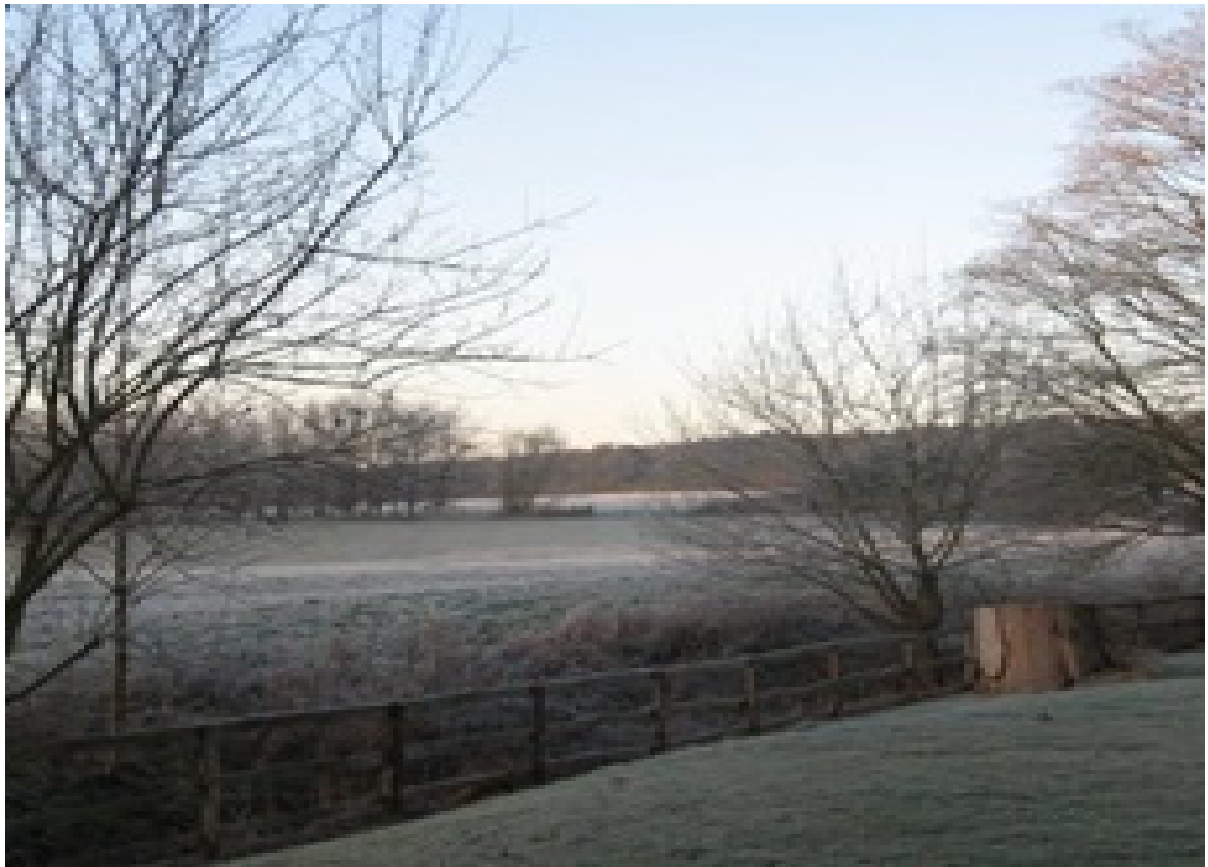
WINTRY MORNING SCENE FROM WENTWORTH HOUSE