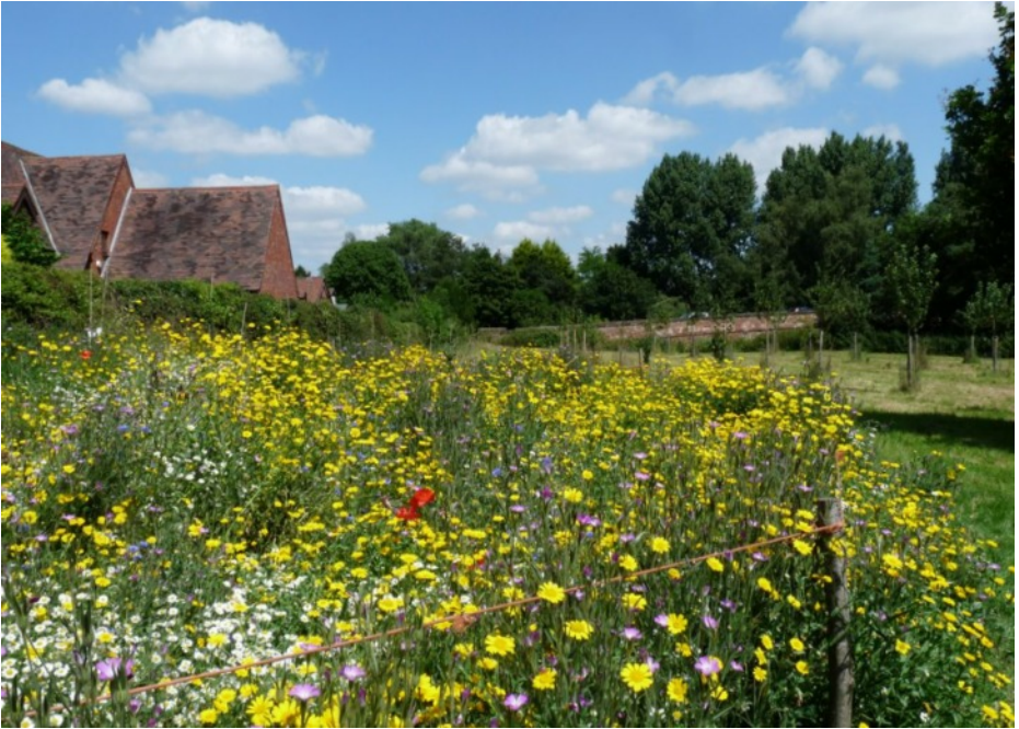
Stoneleigh Community Orchard Wild Flower Meadow