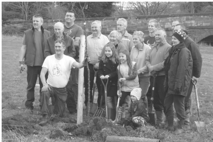
Orchard Project Workers - The First Planting