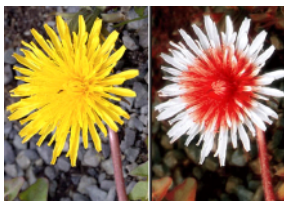
A Dandelion in natural and UV light

Bees not only see flowers in different colours from those we see, but also see ultra-violet light patterns, invisible to us, at the centre of the flower that are a different colour from the rest of the flower. From a bee's-eye-view, the UV colours and patterns in a flower's petals dramatically announce the flower's stash of nectar and pollen. These UV patterns serve as a landing zone, guiding the bees to the nectar source.