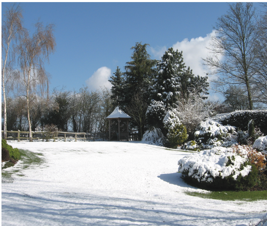
Winter scene at Wentworth House